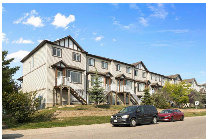
1-240 Laffont Way, Fort McMurray, AB