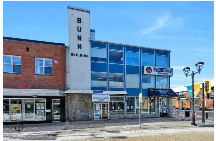
2nd Floor-4820 50 Ave, Red Deer, AB

Come view this office space in the Bunn Building! Great exposure along Little Gaetz with access to many popular shops and restaurants, and plenty of action in the summertime with markets happening every week. This space is 1,612 sq ft and is located on the 2nd floor, but has elevator access. The space has 8 separate rooms that could be used as offices, one is large enough for a boardroom with a sink and cabinetry for storage. There is plenty of natural light streaming in through large windows. Building offers common washrooms and 1 elevator. Monthly rents are all inclusive with no other expenses and there are no long term commitment required.