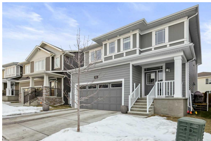
68 YORKVILLE PASSAGE SW RES. MEASUREMENTS PROVIDED BY CANADIAN MAIN LEVEL (AG) - 894.59 Sq Ft / 83.11 m 2 UPPER LEVEL (AG) - 1,218.08 Sq Ft / 113.25 m 2 TOTAL ABOVE GRADE RMB SIZE - 2,112.67 Sq Ft / 196.36 m 2

** QUICK POSSESSION READY ** Shop and compare! ** This popular Mattamy home model has the best home quality you want! This large 2-story has over 2113+ sq ft of bright, airy living space and a coveted basement side entry. Pinterest details include modern décor & colors, custom trims/baseboards, high 9' ceilings, and "CHEFS STYLE KITCHEN," making this a perfect entertaining home. Gorgeous kitchen with island / flush breakfast bar, huge walk-in pantry, white QUARTZ counters, under cabinet lighting, dramatic island with an undermount stainless steel sink, recessed pot lights, stainless steel appliances, and white subway tile backsplash detail. It is an exquisite home. The main floor family room also has a sleek fireplace & lots of room to relax. Upstairs, you'll find three bedrooms, an upper laundry room & a bonus room with white railings, and a storage closet. The primary bedroom features a 4-piece ensuite - his & hers stations (Upgraded separate shower) and an oversized walk-in closet. Exterior: Two side yards (not a zero lot line), cement fiber siding, and covered entry. The pie-shaped backyard is fully fenced and landscaped – this home is ready to move into and enjoy! Don't miss this opportunity. Call your friendly REALTOR(R) to book your viewing right away!