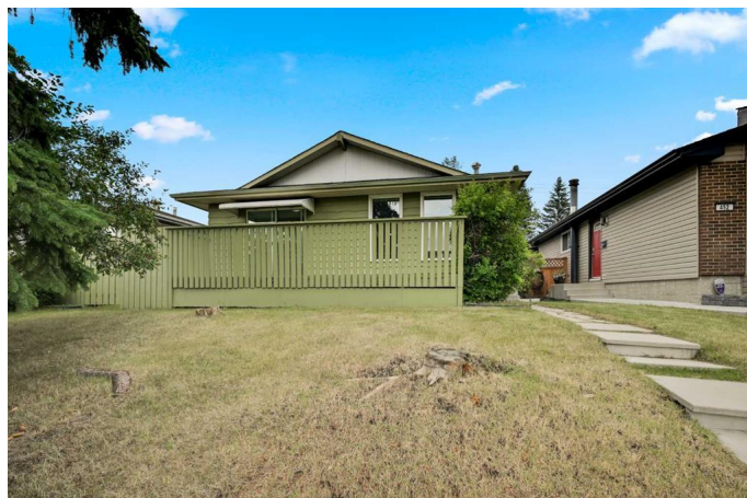
450 78 Ave NE, Calgary, AB

1996 sq ft TOTAL LIVEABLE SPACE | ACROSS FROM GREEN SPACE | 5 MIN WALK TO ELEMENTARY SCHOOL | LOW MAINTENANCE BACKYARD| CONCRETE RV PARKING PAD | Welcome to 450 78 Ave NE, a family friendly home in the quiet neighbourhood of Huntington Hills. This functional bungalow offers spacious 1996 sq ft of livable space with 3 bedrooms up and 1 bedroom in the basement. Upon entry you will be greeted by the beautiful cherry oak hardwood floor and 2 bright windows. The double sliding patio doors in the dining area will take you to the SOUTH facing front deck, perfect for family entertaining. Updated kitchen comes with granite counter tops, newer stainless steel stove and refrigerator. The Separate entrance/side door will take you to the developed basement with an extra bedroom & a 3 piece bath. The concrete pad (15.5 ft width x 26.5 ft long) in the backyard is perfect for your mid size RV parking. The low maintenance backyard is ideal for your busy life style. Newer Samsung Washer & Dryer - 2023, Roof - 2012, Garage Roof - 2018, High Efficiency Furnace. Deerfoot City, Thornhill Aquatic & Recreation Centre, Library, Superstore, Save-On-Food, Restaurants and major roadways are minutes away, perfect for all your family needs.