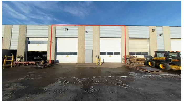
7491 49 Avenue

Washrooms Radiant Heaters Upstairs Mezzanine