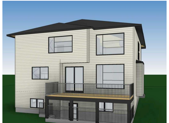
24 N Bridges Glen, Langdon, AB